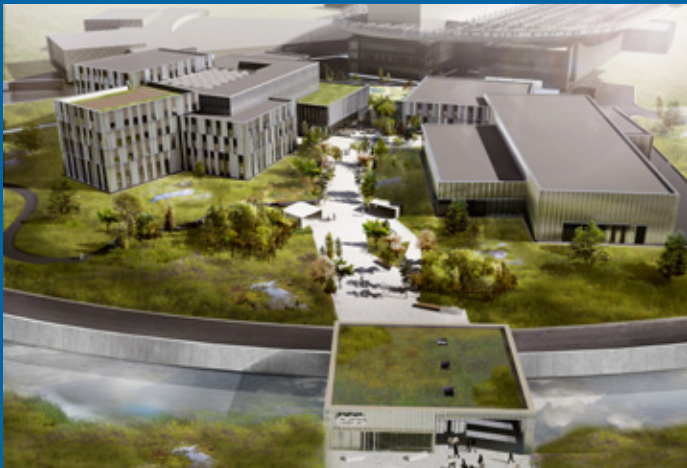
Artist's impression of the European Spallation Source research base in Sweden which will use JFN's specialised equipment

JFN, 'and we were delighted to win such a high profile contract to deliver a robotic handling system in May of this year and play our part in making the ESS the next great "Big Science" research facility.' JFN will design, manufacture, install and commission an integrated package of remotely operated manipulators, hoists and cranes to handle the radioactive components produced as a by-product of ESS research activities. ESS is one of Europe's largest science projects, backed by 17 European countries and constructed as an accelerator-based facility to produce neutrons for a large array of advanced instruments. It is designed to enable scientists to understand basic atomic structures and forces and will make new opportunities for scientific discovery possible for researchers in materials and life sciences, energy, environmental technology, cultural heritage and fundamental physics. 'This marks a significant step in the strengthening commercial relationship between UKAEA and JFN and firmly establishes JFN as one of the pre-eminent nuclear remote handling businesses in the UK,' adds Stuart.