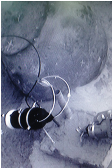
Unexploded ordnance ready for clearance by JFMS specialists

The JFMS team has been able to move on to Triton Knoll hot on the heels of similar work at East Anglia One, and is expecting to move the team and clearance vessels directly to another wind farm clearance project when Triton Knoll is complete. Clearance work of this kind is critical to the safe and efficient installation of the 90 turbines, two offshore substations and miles of inter-array and export cables that make up the 857 megawatt (MW)2 wind farm. The UXO haul is likely to be significant because Lincolnshire was dubbed 'Bomber County' during World War II as the bulk of the UK's bombing force was based there. Many will have been forced to jettison any unused bombs into the sea close to the coast on returning from missions. Jennie Kevis-Stirling, survey specialist for JFMS adds: 'This contract win shows clearly that the provision of pre-installation services for offshore wind farms is now a core offering for JFMS. The team is continually growing in